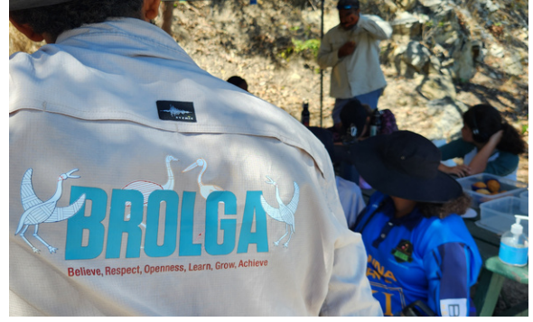
BROLGA Junior Rangers event at Corio Bay.