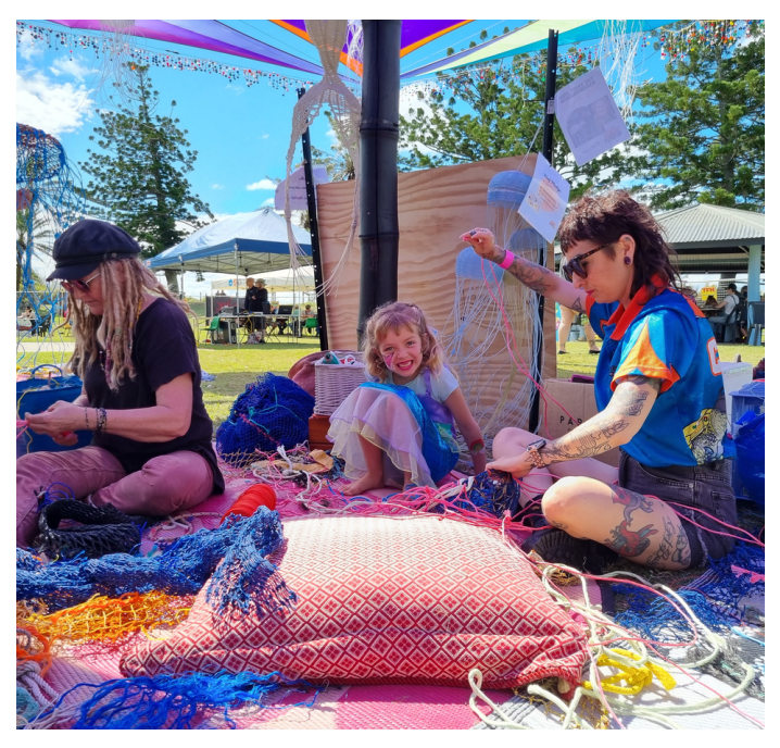
Ghost net weaving at the Sandy Krak Reef Festival.