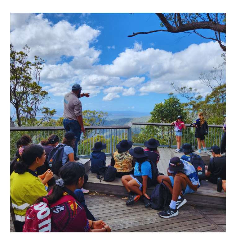
BROLGA Junior Rangers event at Mt Archer (Nurim).

Community, Traditional Owner and youth workshops identified the eight top priority values for their region, including Traditional Owner connection to people and Country, protecting coastal ecosystems, reducing emissions, and building youth engagement and stewardship.