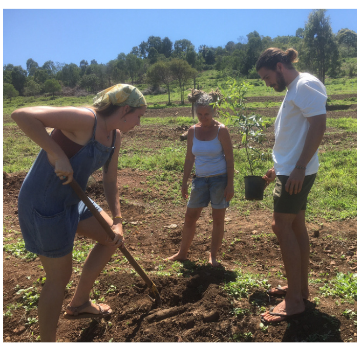
Planting native trees in the High Valley Dawn Permaculture garden.