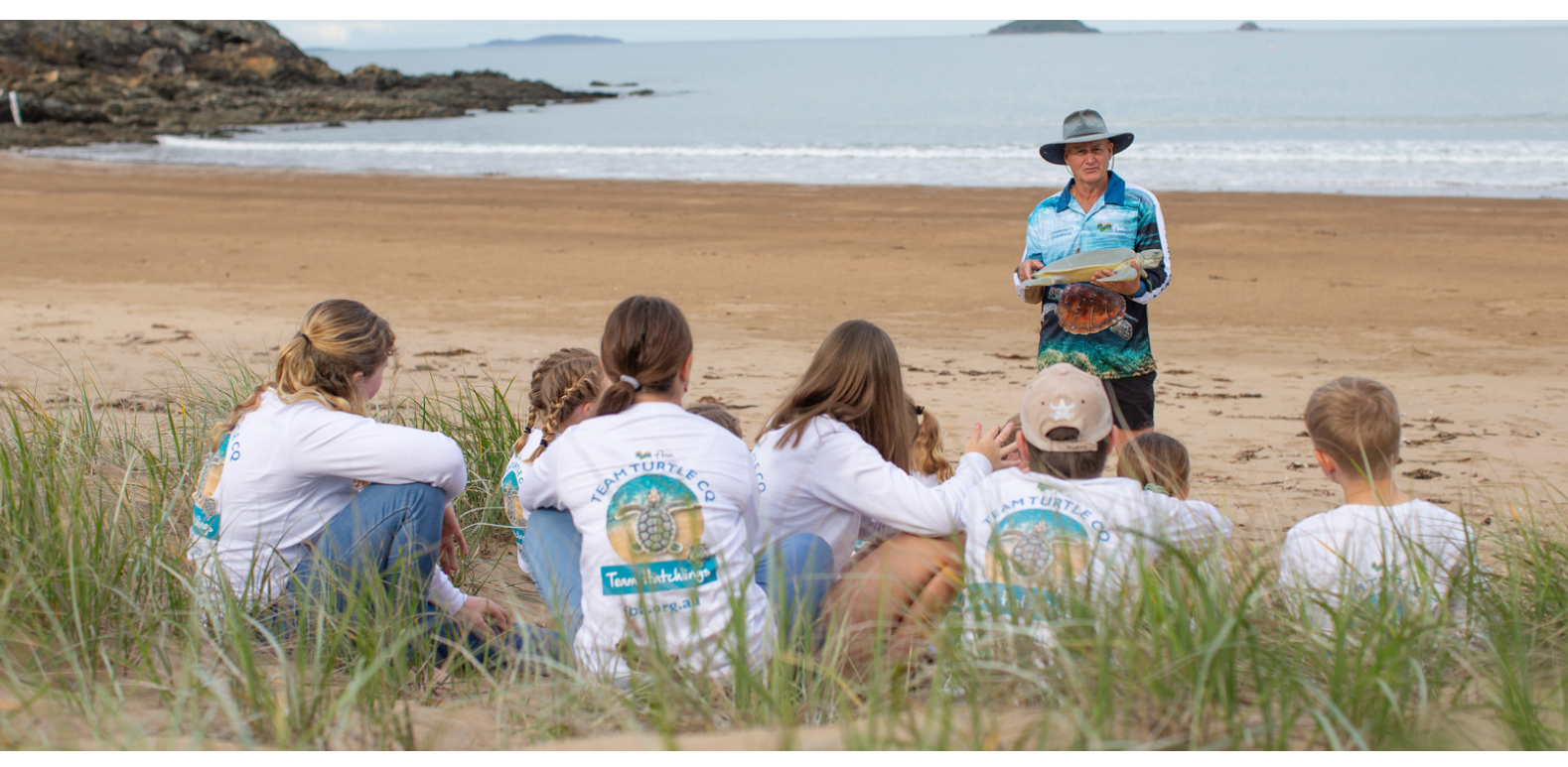
Team Hatchlings education event.

We extend our deepest respect and recognition to all Traditional Owners of the Great Barrier Reef and its Catchments as First Nations Peoples holding the hopes, dreams, traditions and cultures of the Reef.