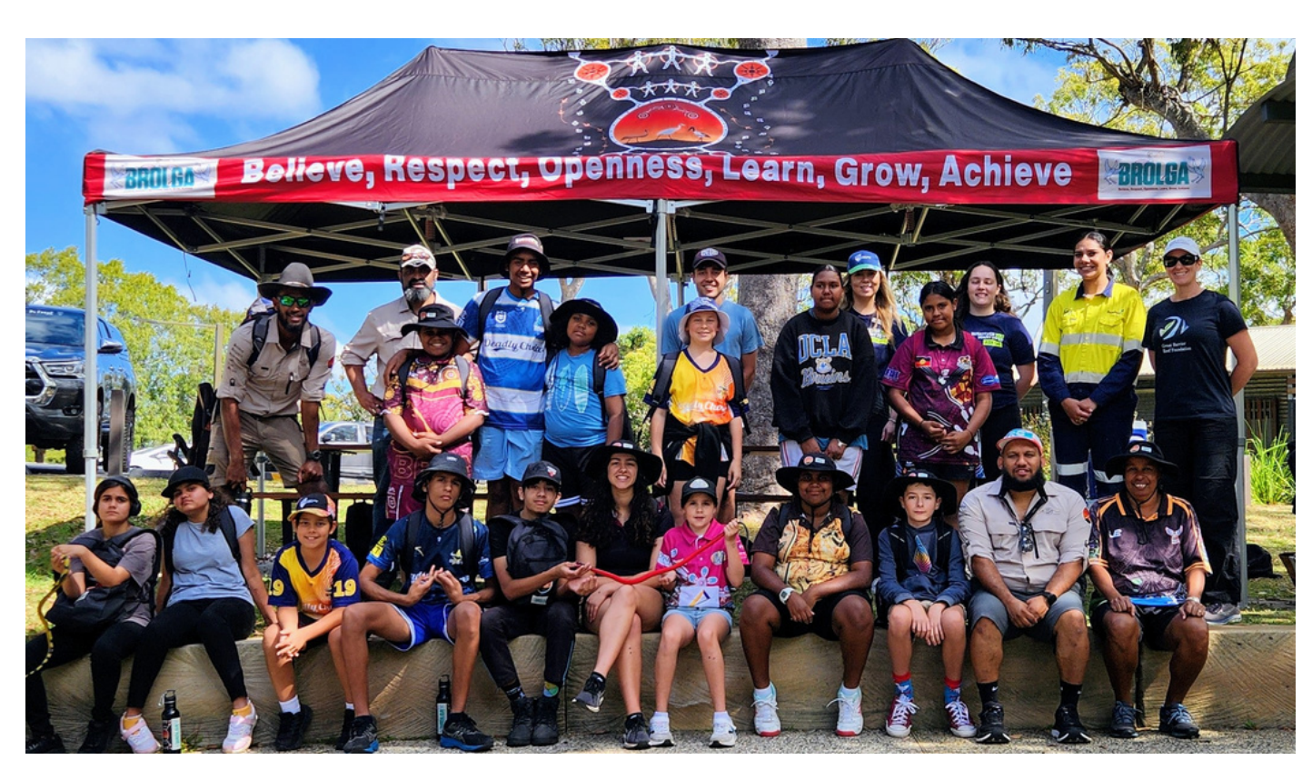
BROLGA Junior Rangers event at Mt Archer (Nurim).