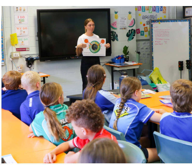
Waste education program at Cannonvale State School.

CAP Leader staff have taken knowledge and skills they developed during the CAP development process and embedding them into new organisations they are currently working with. Additionally, Reef Catchments continue to translate the needs of the community into 'shovel ready' prospectus documents which can be marketed to private investors.