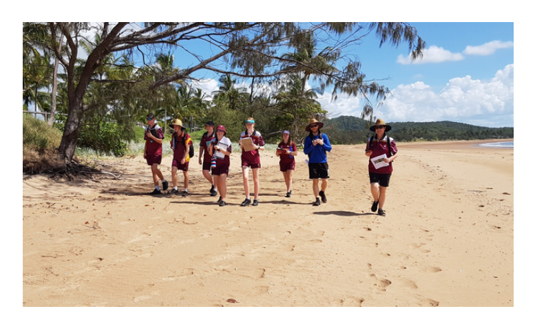
Sarina State High School students learning about coastal rehabilitation at Grasstree Beach.

The three natural values deemed most important to the community were coral reefs, catchments and estuaries, and mangroves. The top priorities that emerged from Traditional Owner and community feedback were climate change, litter and waste, revegetation, and water quality.