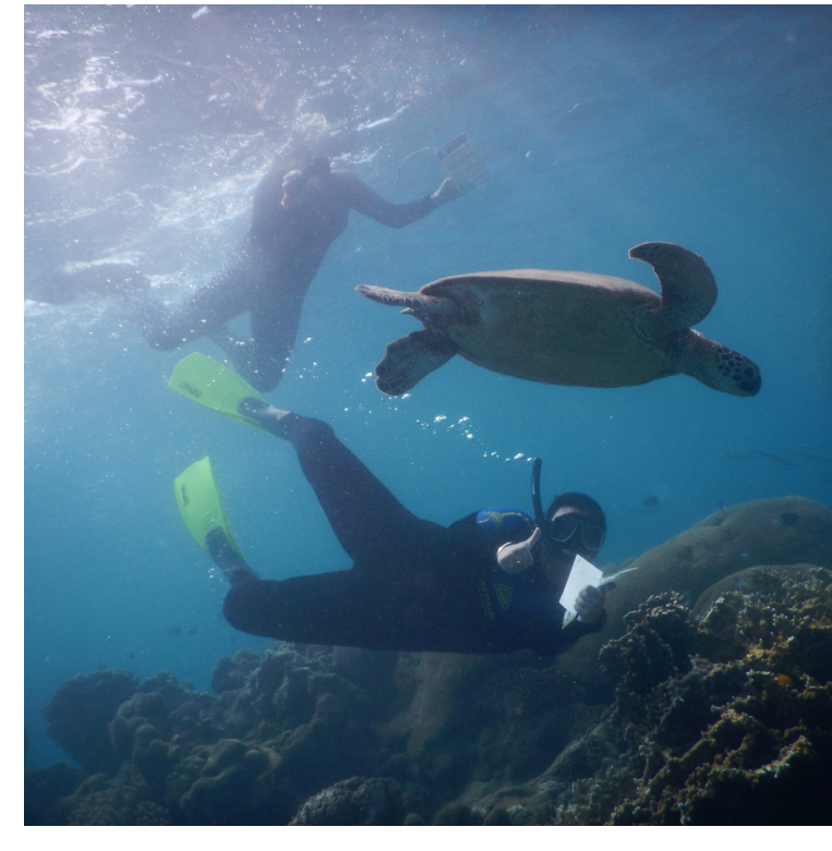
Marine classroom in the Whitsundays.

The Community Action Plan (CAP) Program is a pilot program for place-based collaborative planning and delivery to enhance community Reef protection for the Great Barrier Reef World Heritage Area. CAPs connect community aspirations with regional and Reef-wide priorities by: