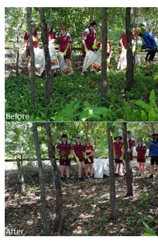
Sarina State High School students removed 90kg of weeds at Grasstree Beach so native coastal vegetation can grow.

Expanding community participation is key for success to support delivery of on-ground CAP projects. A citizen science calendar is being piloted to bring more visibility for participation opportunities.