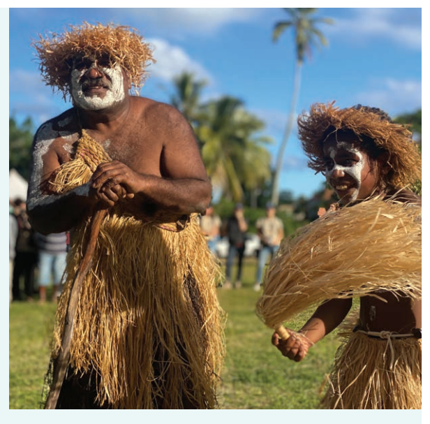
Community members taking part in The Turtle Days event in New Caledonia, July 2021.

Our partnership with New Caledonia will continue to focus on ways to limit climate risks and enhance protection of local resources. This includes focusing on support to managers and local providers for strategic and effective management planning, and better recognition of customary laws and cultures in natural resource management. Following the release of their Resilience Strategy framework in late 2022, we will work with local partners to co-design and fund implementation of a series of flagship actions focusing on addressing local and global threats such as: water quality and ecosystem degradation, climate risks, and unsustainable resource use.