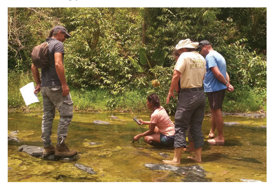
Watershed Management Workshop in New Caledonia.