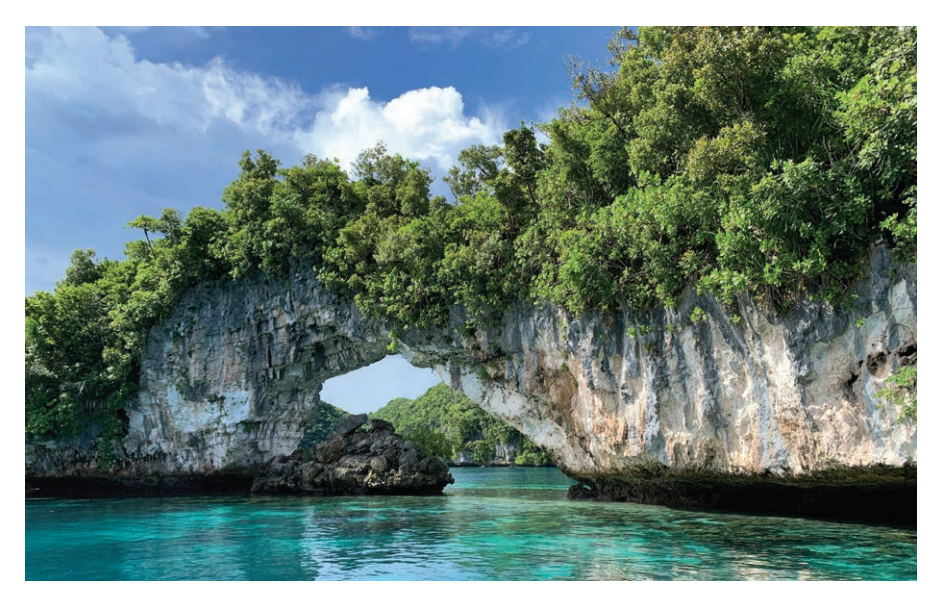
Palau's\ natural\ rock\ arch\ formations.\ Credit:\ Amy\ Armstrong.

The world is watching Palau. This large ocean state is a fierce advocate for ocean conservation and climate justice. Palau is the only nation on earth to have protected 80% of the marine environment and put a stamp in your passport saying you will protect the natural resources. However, they also face important challenges, like the need to expand and diversify livelihoods—an imperative that has been felt most acutely during the tourism shutdown caused by the COVID pandemic. RRI's partnership in Palau kicked off in 2022 with local hires of a Chief Resilience Officer and Resilience Advisor. The team is setting up local governance and progressing through development of its Resilience Strategy, which will help identify the priority challenges we will tackle together.