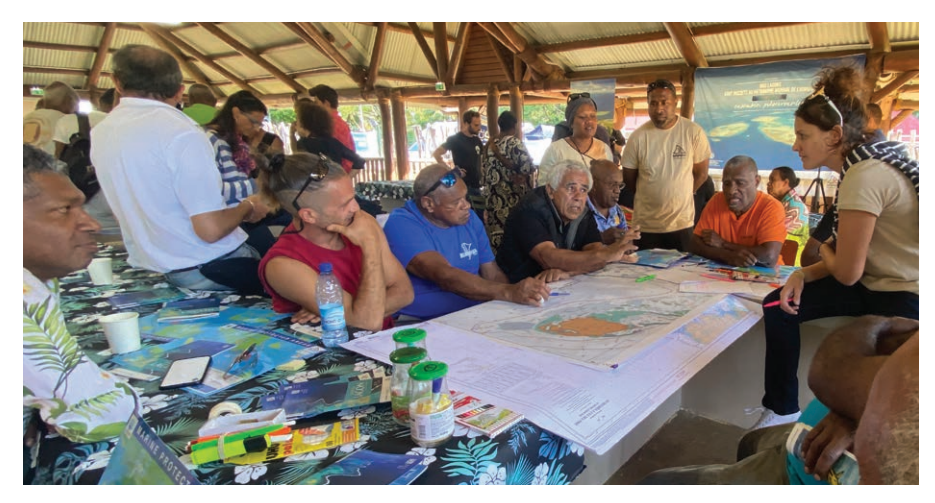
New Caledonia co-management discussions.

As part of local turtle celebrations on the Southern Province's Isle of Pines in July 2021, RRI funded a three-day event on the sustainable management of turtles. The aim was to balance the importance of maintaining traditional customs with the critical need to protect and preserve the dwindling green turtle population. In an historic show of solidarity, all eight local tribes came together and agreed on their own sustainable management plans for their area to protect the species against over-fishing.