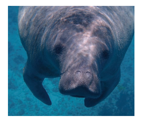
Manatees are among the threatened species that can be found in Belize.