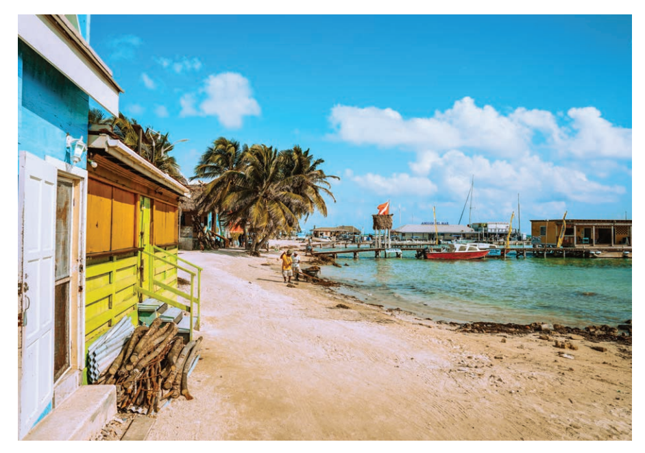
The coastal community at Ambergris Caye, Belize.

Over the course of several months, a multidisciplinary team prepared design and policy proposals that will help inform the Belize Coastal Zone Plan update, Strategic Plan for the Ministry of the blue Economy and the Belize Resilience Strategy.