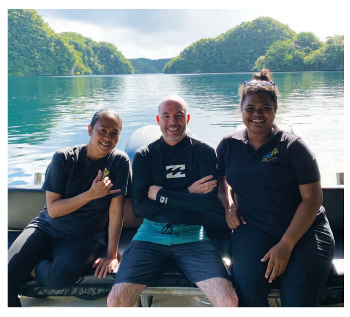
PICRC team members in Palau.

Despite its progressive approach to conservation, Palau is facing the impacts of climate change, declines in seagrass coverage, over-fishing, bleaching events and a need for livelihood diversification to alleviate pressure on the natural environment.