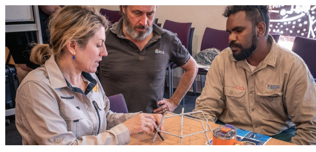
Participants in the TO Restoration Workshop at Ningaloo.

Using Ningaloo Reef as a test case, this framework aims to identify and articulate key factors of reef restoration trials, if and when the time comes that intervention is necessary to buy the reef time while emissions are reduced. It considers how restoration efforts can be designed to ensure coordination, transparency, and meaningful engagement between management, researchers, community, Traditional Owners, and tourism operators, which emerged as key constituencies at Ningaloo. The framework aims to inform similar reef, marine park, and coastal resource management agencies worldwide. It is informed by facilitated internal discussions with managers; a review and application of global best practices to the ecological, socio-economic, and governance contexts at Ningaloo; and a workshop with Traditional Owners: "Healing Sea Country: The Role of Restoration?".