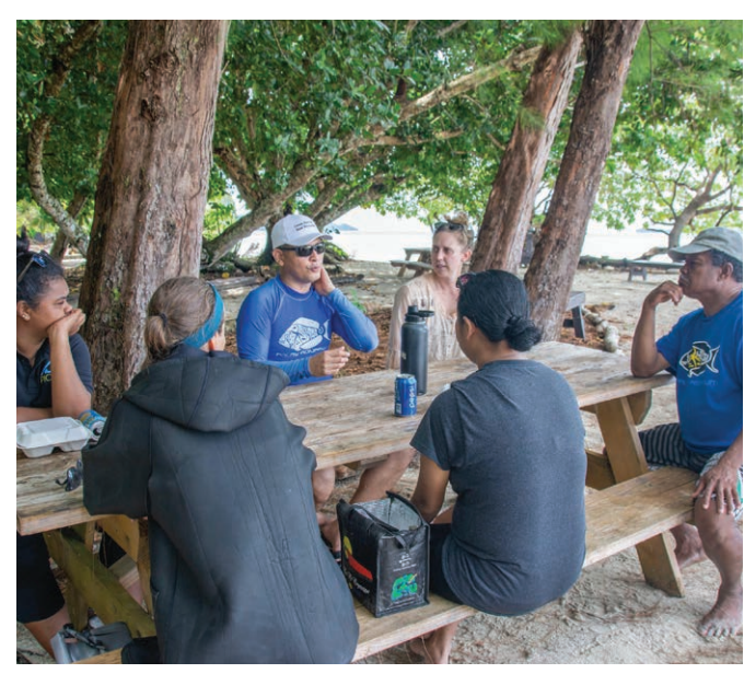
The RRI and PICRC team on site in Palau.