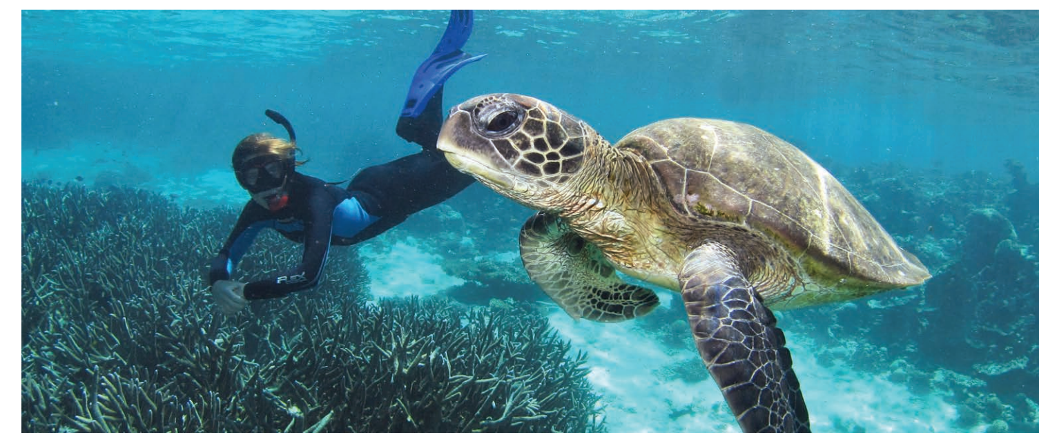
A diver encountering a green turtle on the Great Barrier Reef.