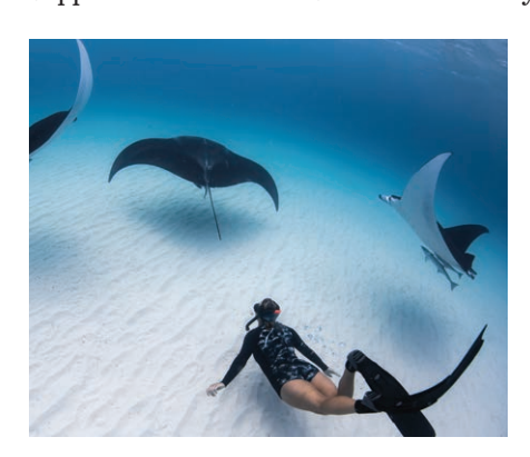
Coral Bay manta swim.

We commissioned a study to enhance local understanding of the value of ecosystem services that Ningaloo Reef provides. The assessment, conducted by Deloitte Access Economics, helped illustrate just how significant an economic contributor Ningaloo reef is ($110 million in value added to the state economy in 2018-19 and more than 1,000 full time jobs). The study highlighted how essential it is to protect this unique ecosystem, so it can continue to be enjoyed by all and support local livelihoods and the economy.