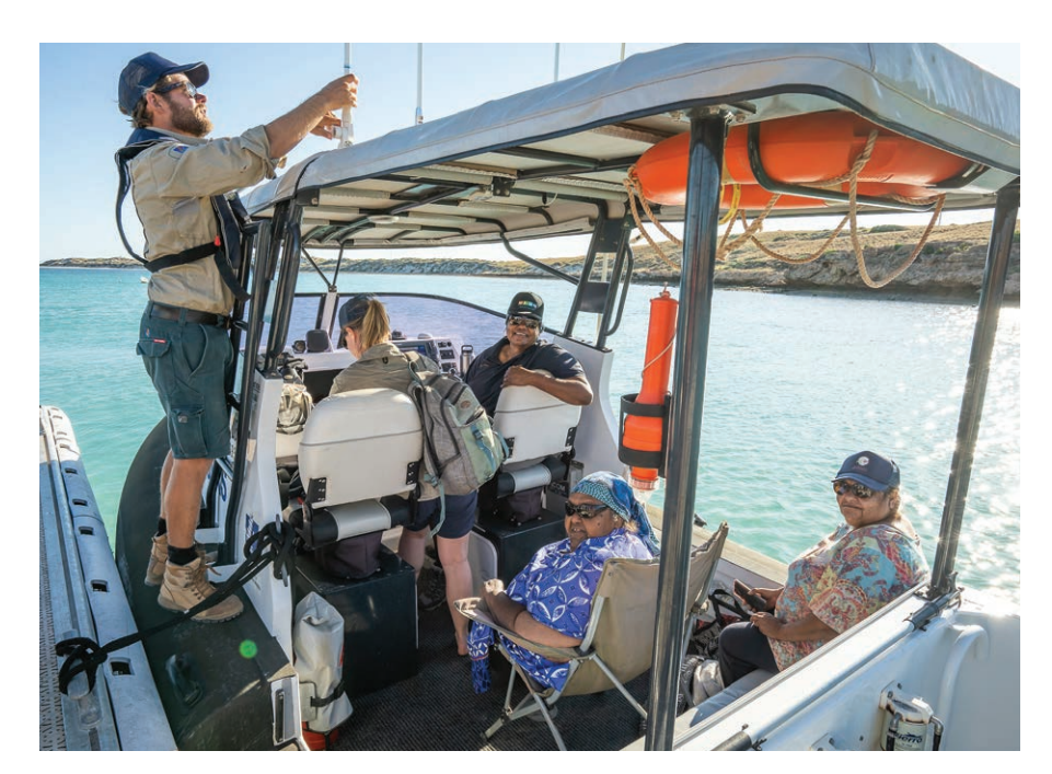
Cultural mapping of sea Country with Traditional Owners at Ningaloo.

Traditional Owners have requested this approach to engagement in future work, and Ningaloo's Chief Resilience Officer is advocating to research institutions to fund robust and early workshops to ensure Traditional Owners have a seat at the table from the early stages of project design.