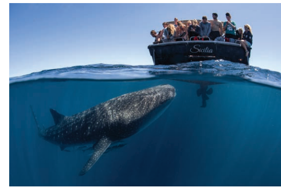
A curious whale shark approaches a tourism vessel at Ningaloo Reef.