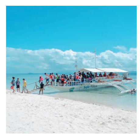
Tourists flocking to coral reef communities.

One of the ways Resilient Reefs drives local impact with global expertise is through the Solution Exchange program: an annual workshop bringing together multiple disciplines to advance thinking and accelerate action on common problems facing reef managers and communities across the Initiative's pilot sites.